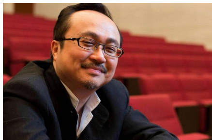
Pianist Dang Thai Son will perform in March 2019.

In March, Vietnamese-Canadian pianist Dang Thai Son will give a recital of music by Schubert and Chopin. In 1980, Son became the first Asian pianist to win first prize at the International Chopin Piano Competition in Warsaw. He was recently appointed professor of piano at the prestigious Oberlin Conservatory of Music.