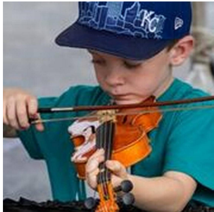
Among the day's activities is an instrument petting zoo.