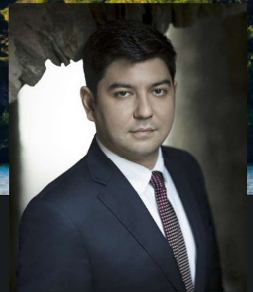
FEATURING: BEHZOD ABDURAIMOV

PARK UNIVERSITY INTERNATIONAL CENTER FOR MUSIC